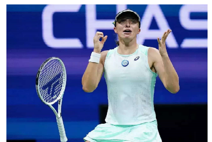
Iga Swiatek will face Ons Jabeur in US Open final on Saturday.

Swiatek said. "For sure I felt lighter. I'm sorry — that's disgusting."